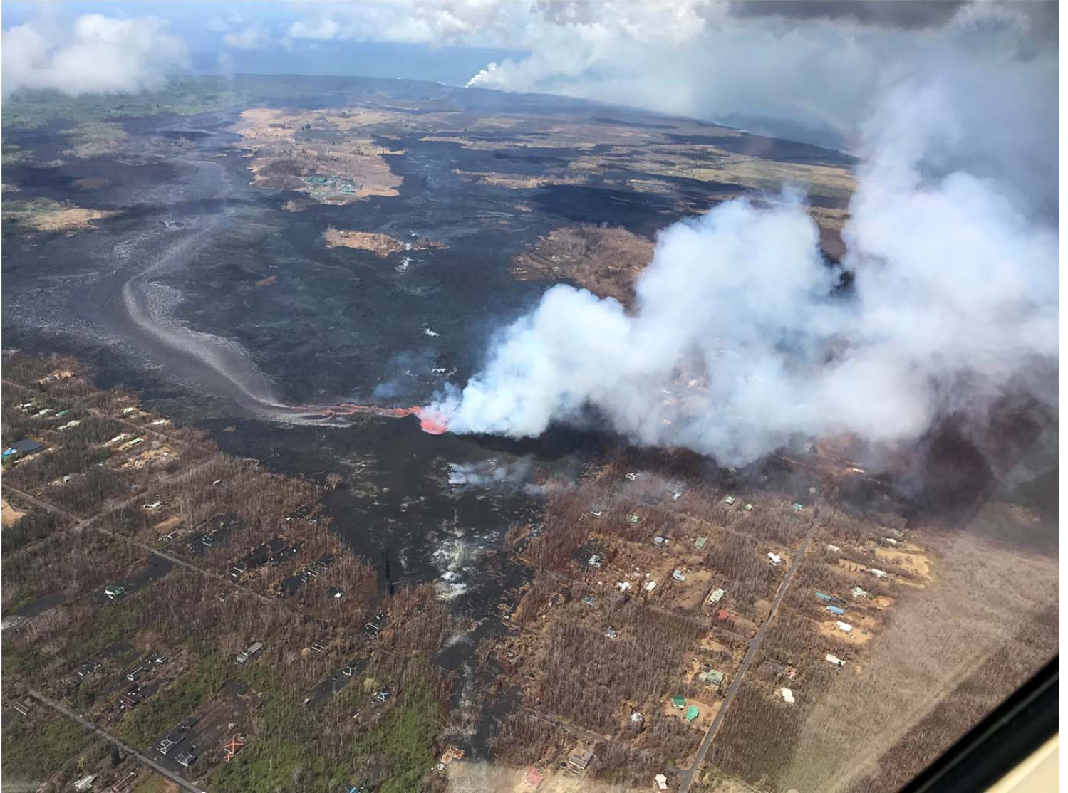
July 5, 2018 at Pahoa, Hawaii

If you would like to submit a photo, email them to secretary@sandiegogeologists.org and I will try and put them in the newsletter. Provide a short description of the picture.