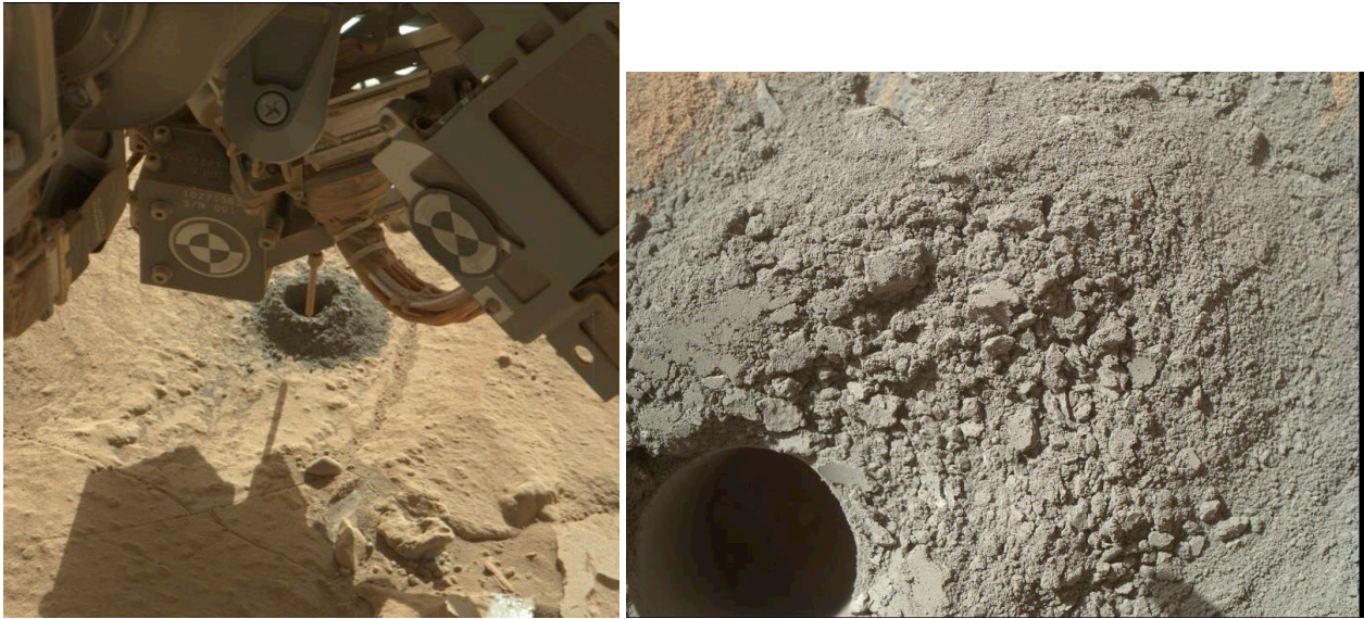
Windjana Drill target – MCAM taking a picture of MAHLI taking a picture of the drill hole and tailings on left; MAHLI image of drill hole and tailings on right.