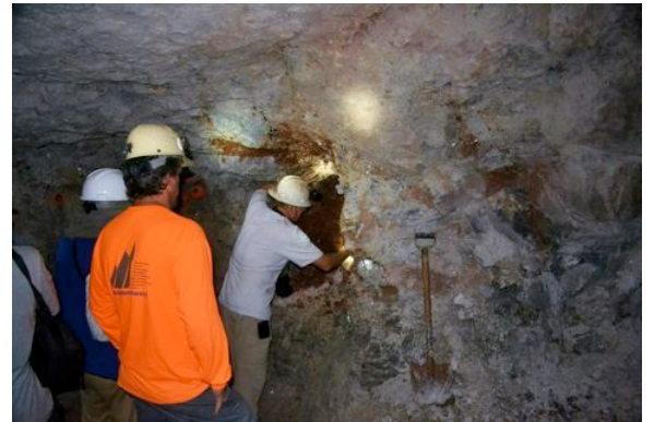
Inside the Oceanview Mine