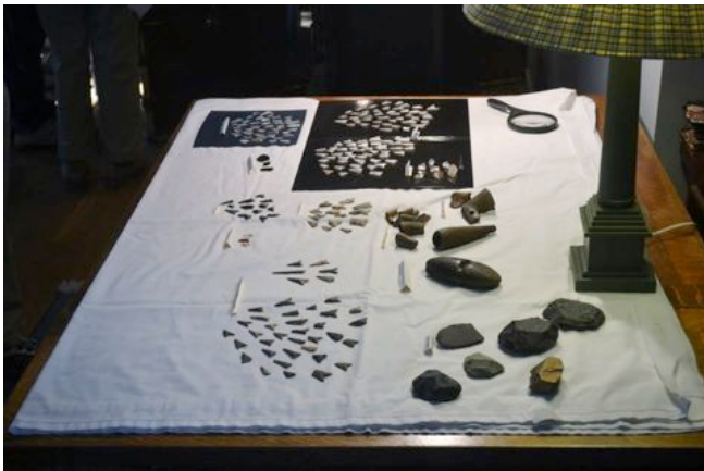
Artifacts from the Molpa Archaeological site