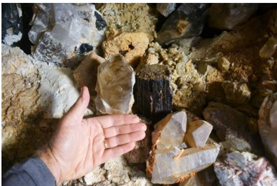
Specimens from the Oceanview Mine