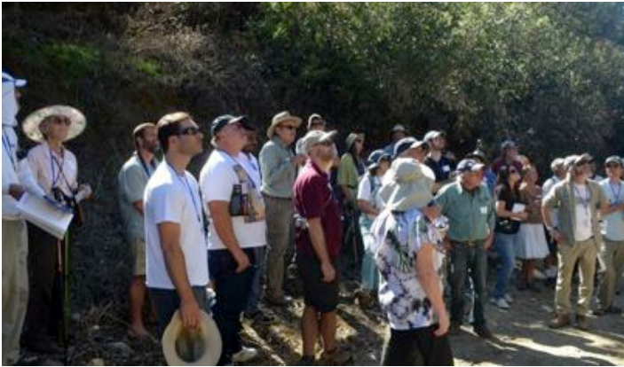
Observing landslide features in the distance