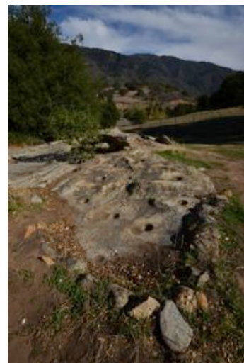
Metates at the Molpa Archaeological site