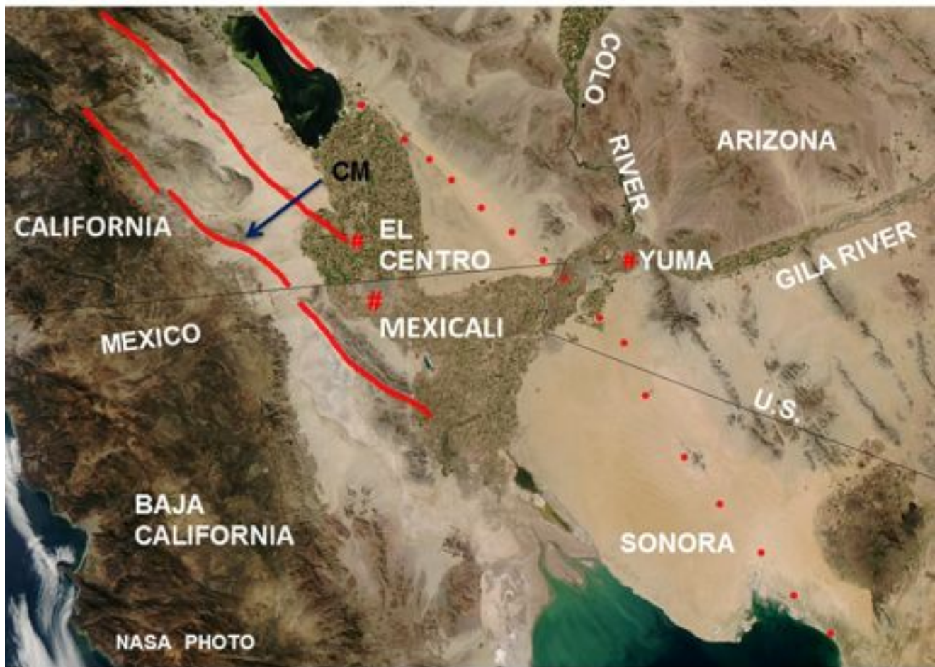
Photo index map. CM indicates location of Coyote Mountains.