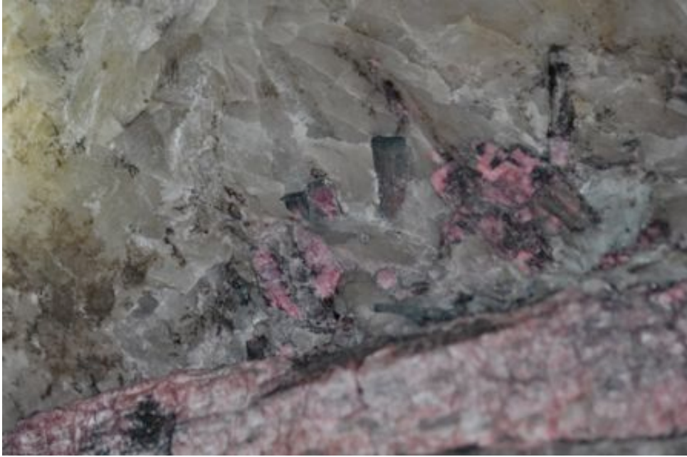
Colored tourmaline crystals imbedded in a quartz pod – Ocean View Mine