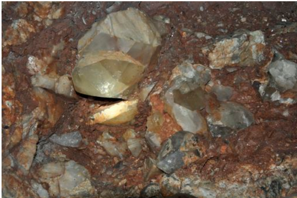
Quartz crystal pocket – Ocean View Mine