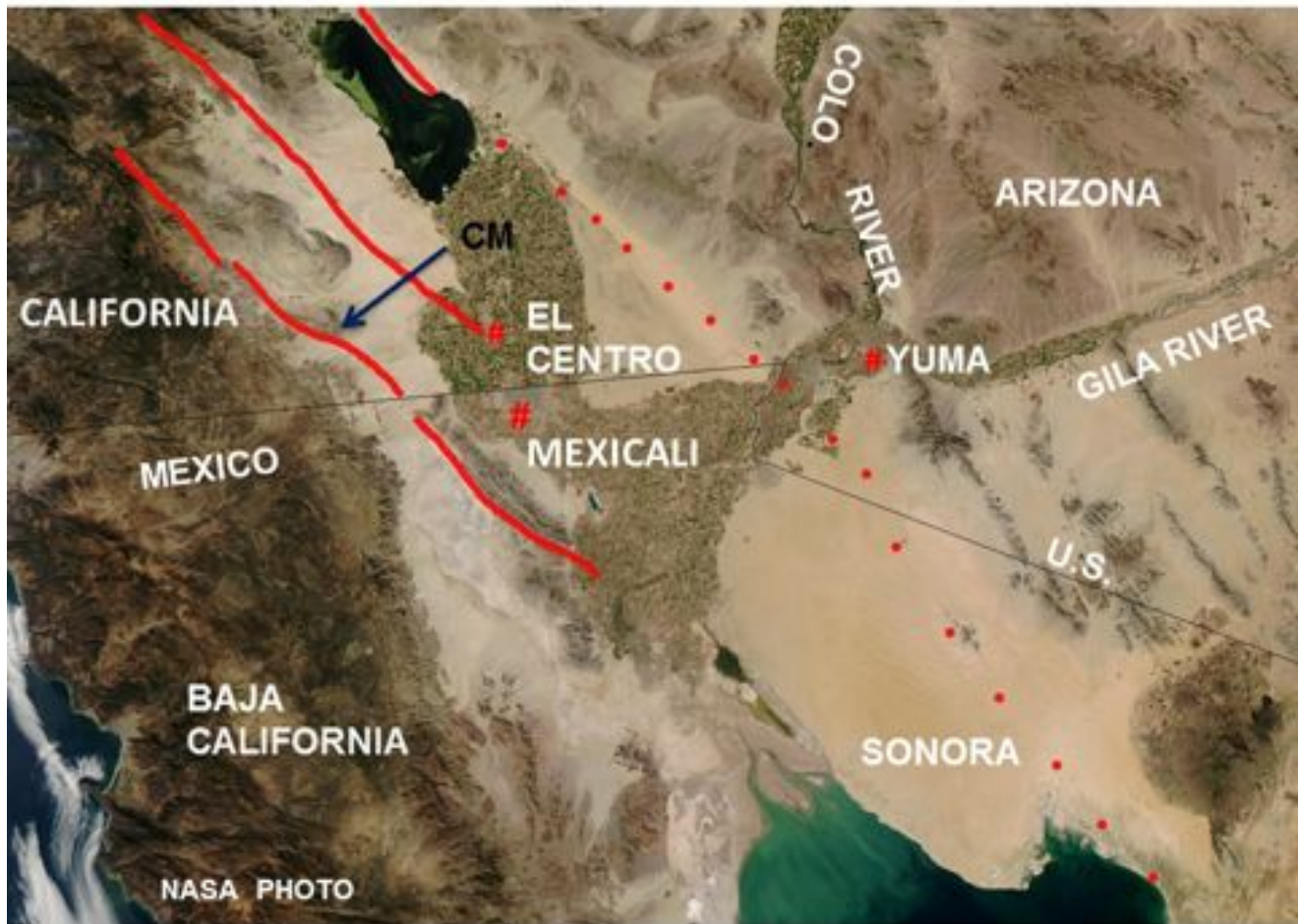
Photo index map. CM indicates location of Coyote Mountains.