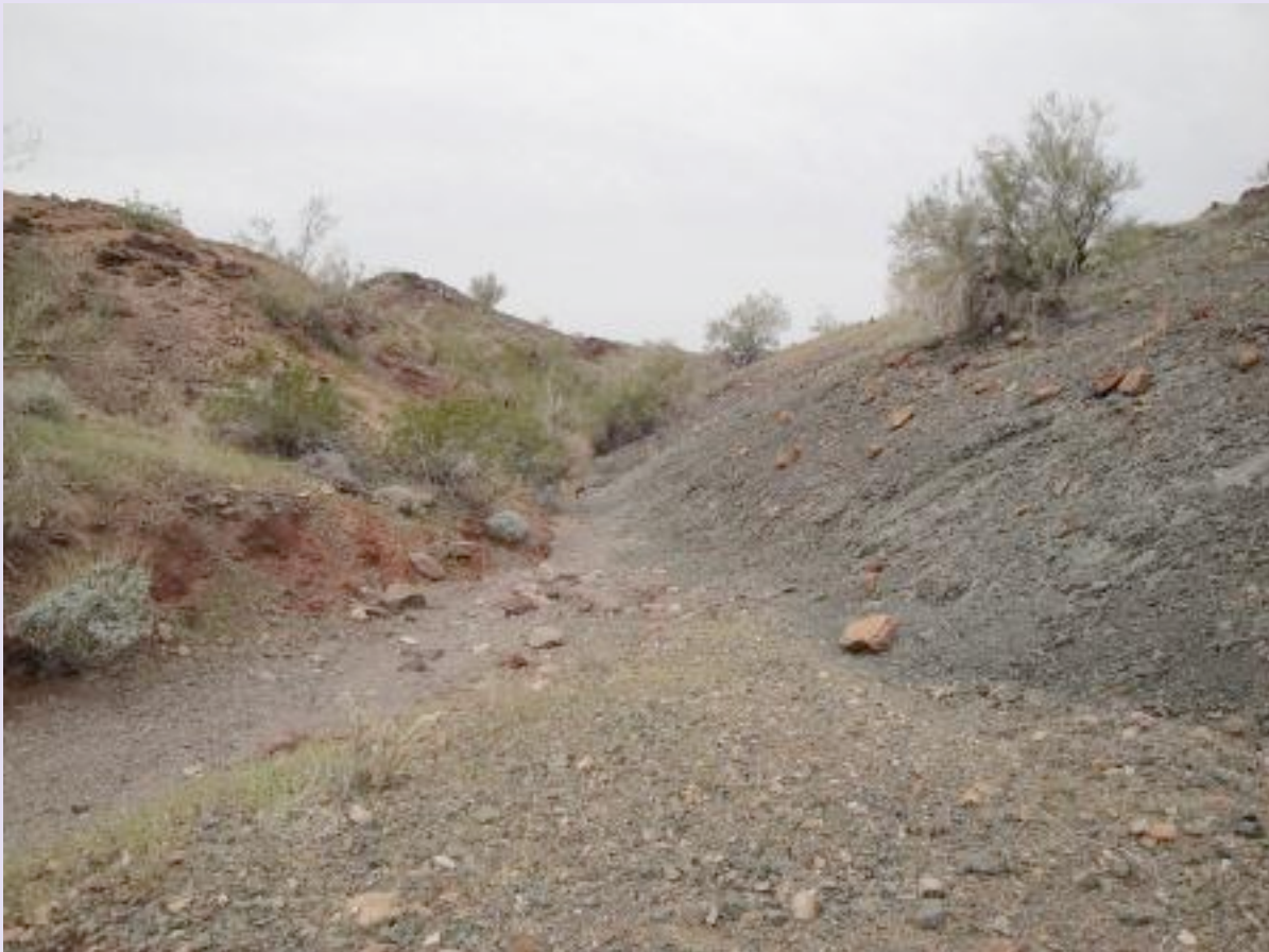
Photo showing a nice fault ramp dipping to the left with lower plate green Precambrian-aged chlorite schist to the right and red upper plate Tertiary-aged volcanics to the left.

I was privileged to spend Saturday, March 19 th , in the Trigo Mountains of western Arizona with the annual SDSU alumni field trip. Twenty-two years ago, I mapped about 2.3 miles of the North Trigo Detachment Fault in a very long day using a xerox copy of a USGS topographic map. On the 19 th , Todd and I re-mapped a little over two miles with Google Earth images in about 4 hours. Love that Google Earth!