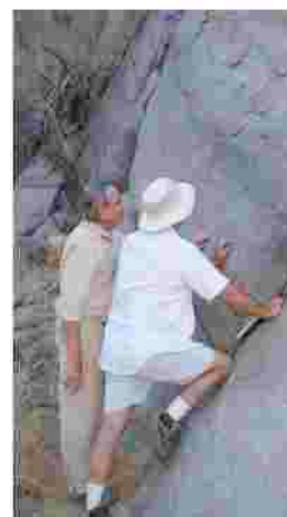
Getting one's nose up to the rocks!