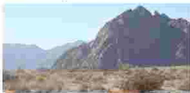
The ancient Lake Cahuilla "bathtub ring" near the campground