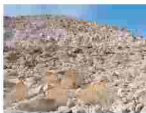
Tufa covered boulders below ancient Lake Cahuilla's shoreline