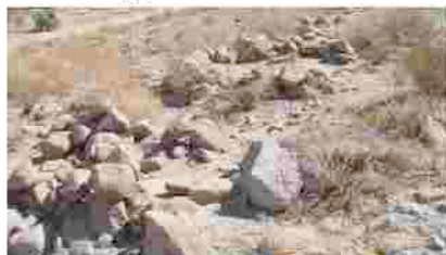
Fish traps along Lake Cahuilla