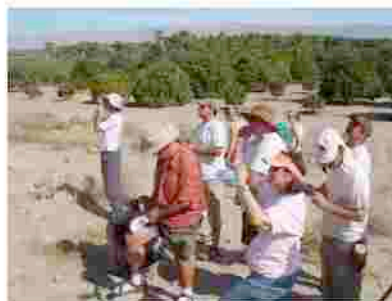
Looking for petroglyphs