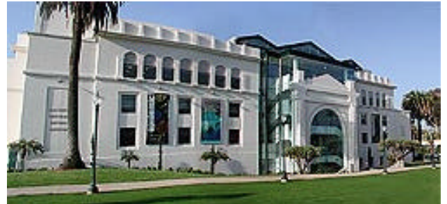
San Diego Natural History Museum

Where: San Diego Natural History Museum 1788 El Prado, Balboa Park (619) 232-3821